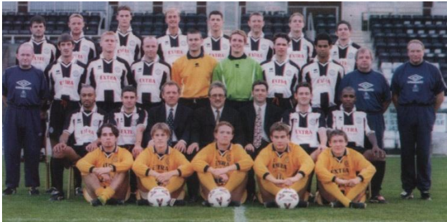
The Hednesford Town 1998-99 squad.