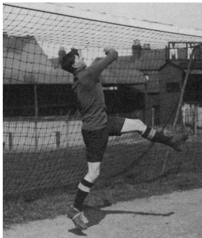
Practice makes perfect.