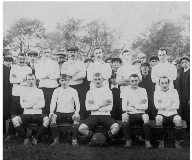
Hednesford Town: 1909-1910 Birmingham Combination League Champions.