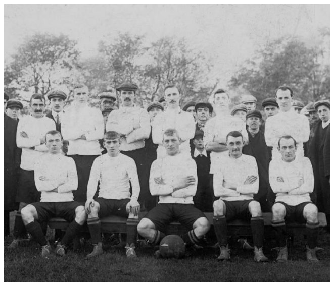
Hednesford Town: 1909-1910 Birmingham Combination League Champions.